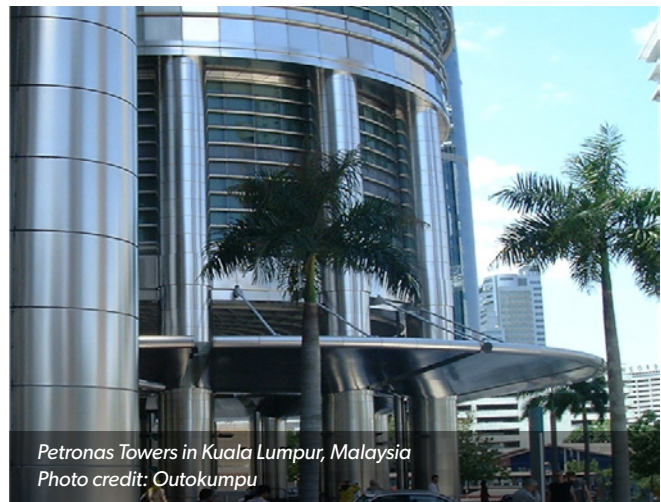
Petronas Towers in Kuala Lumpur, Malaysia