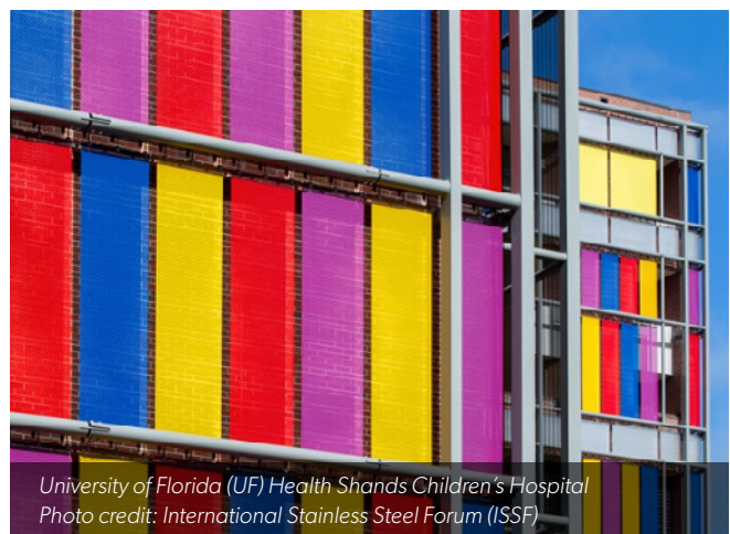
University of Florida (UF) Health Shands Children's Hospital

IMPORTANT DISCLAIMER: The technical recommendations contained in this publication are necessarily of a general nature and should not be relied on for specific applications without first securing competent advice. Whilst ASSDA has taken all reasonable steps to ensure the information contained herein is accurate and current, ASSDA does not warrant the accuracy or completeness of the information and does not accept liability for errors or omissions.